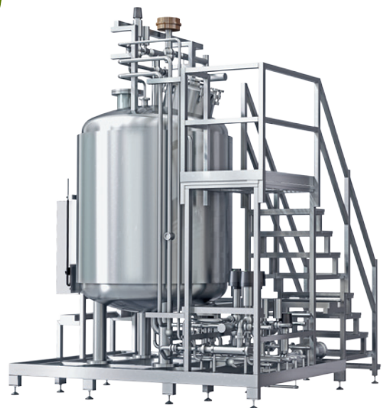
GEA HOPSTAR™ Dry