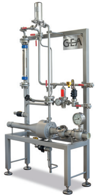
GEA WORTSTAR™ Craft